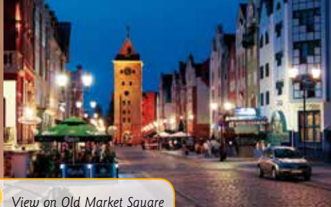
View on Old Market Square

All interested persons should please check opening hours of the sites directly at the given tourist attraction, or at the tourist information centre at Stary Rynek 25 (Old Town) as soon as possible, tel. +48 55 239 33 77, ielblag@umelblag.pl .