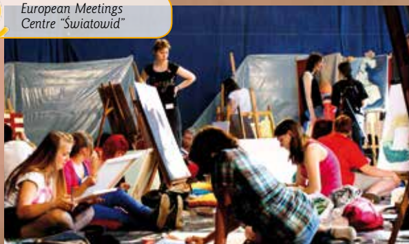
European Meetings Centre “Światowid”

European Meetings Centre “Światowid” (Centrum Spotkań Europejskich Światowid), Pl. Jagiellończyka 1, +48 55 611 20 50, www.swiatowid.elblag.pl A. Sewruk Theatre (Teatr im. A. Sewruka) ul. Teatralna 11, +48 55 641 97 00, www.teatr.elblag.pl Elblag Chamber Orchestra (Elbląska Orkiestra Kameralna), Stary Rynek 25, +48 55 237 47 49, www.eok.elblag.eu