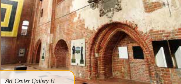
Art Center Gallery EL

Not far from here is the Art Center Gallery EL located in the imposing Dominican church. What is unique here, is the combination of modern art exhibits with historic interior. The EL Gallery is the initiator of the earlier mentioned Biennale of Spatial Forms.