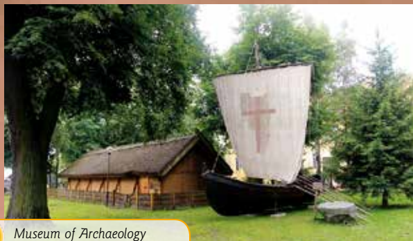
Museum of Archaeology and History in Elblag