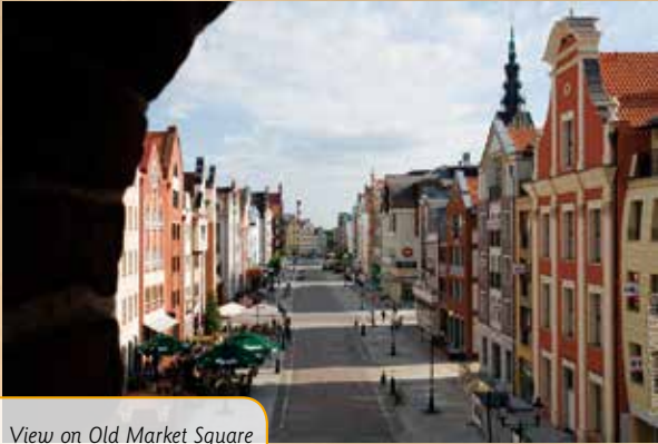
View on Old Market Square

For tourists who can only devote a few hours to explore Elblag, we recommended the following route: