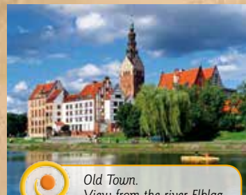
Old Town. View from the river Elblag

We return to the Planty Park (9), which once used to be a party place for the elite social club. On the left, we can still observe metal sculptures, also called spatial forms. Among the park trees, we can admire a rarely seen in Poland – Miłorząd Japoński (Ginkgo biloba). The park ends with a small hill, which is the remnant of the Bastion Młyński [Bastion Mill] which was a part of the XVII century Swedish fortifications of city.